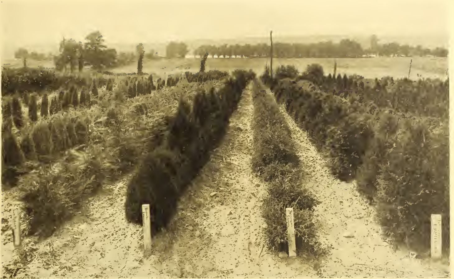
A block of our Conifers. The water in the distance is Carnegie Lake, bounding our farm on one side.